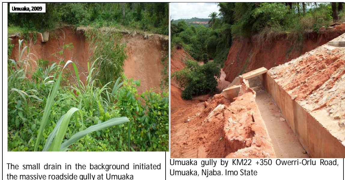
Figure 2: Umuaka Gully

In this area, there are a network of gullies with average depth of 50 m, width of 80 m and length of 2000 m respectively. The gullies mainly originated from poorly constructed side drains and termination of culvert at unsafe points at the Njaba River valley along the Owerri – Orlu road (Figure 2). The gullies originate as narrow rills with a down-slope orientation, which undergo progressive widening and deepening, with successive rainfall events. The poorly terminated drain generated a waterfall effect on the poorly consolidated sandstones and cohesionless soil which resulted in the gully erosion. A good knowledge of surface hydrology would have prevented this scenario by determining the effective runoff and properly designing an effective drain that can accommodate the volume and velocity of runoff generated in the Njaba watershed.