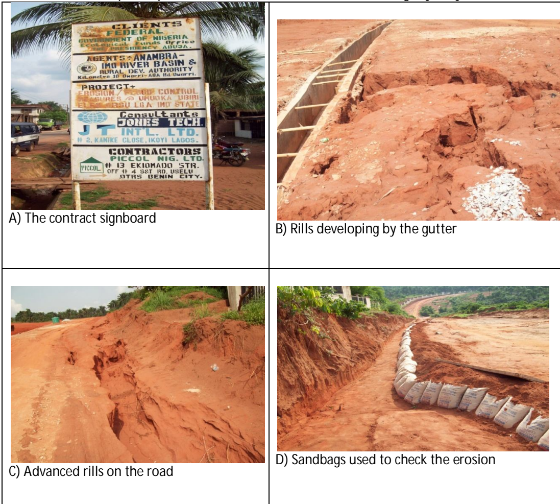
Figure 3: Umuoka Ubiri Elem erosion site

The gully in this site was mechanically bulldozed and flattened out down to the Azezie Asa river. Due to poor work done in terms of soil compaction and defective concrete channel (drainage length - 900m, depth - 1m, width-1m, thickness of concrete - 0.15m, no rip-rap, no groin, no armoury, no detention) rills have begun to develop measuring up to 700 m in length and 1.4 m in depth. Current effort at checking this erosion is the use of sandbags (Figure 3). The power of surface runoff was completely disregarded in this site. In no time, if urgent efforts are not put in place to control the surface runoff, the gully may resurface.