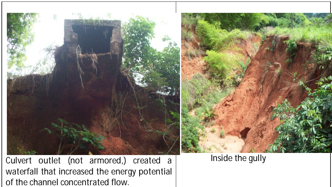
Figure 5: Ogberuru gully formed by drainage

The above listed gully sites as a result of failed drains are by no means the only gullies resulting from the lack of hydrological knowledge application in Imo State.