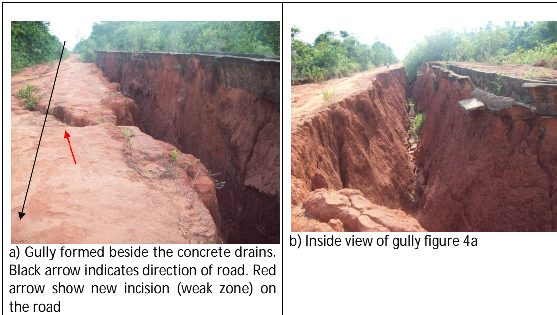
Figure 4: Ikeduru gully

that, at the design stage, the effective runoff for this watershed vis-à-vis the slope was not considered.